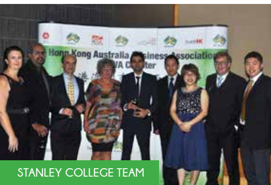
STANLEY COLLEGE TEAM